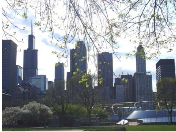
Grant Park in Chicago